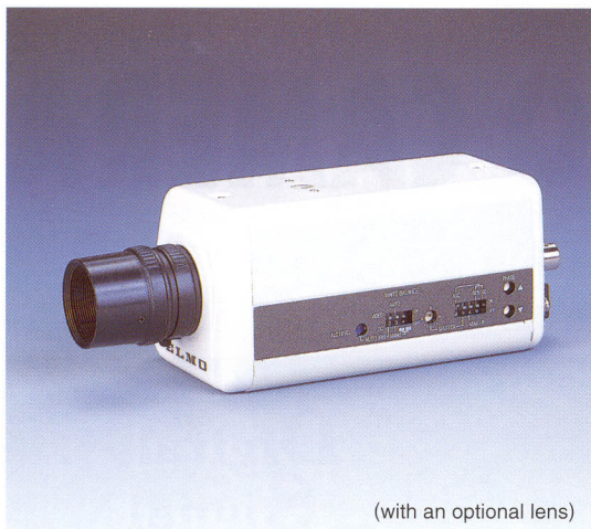
(with an optional lens)